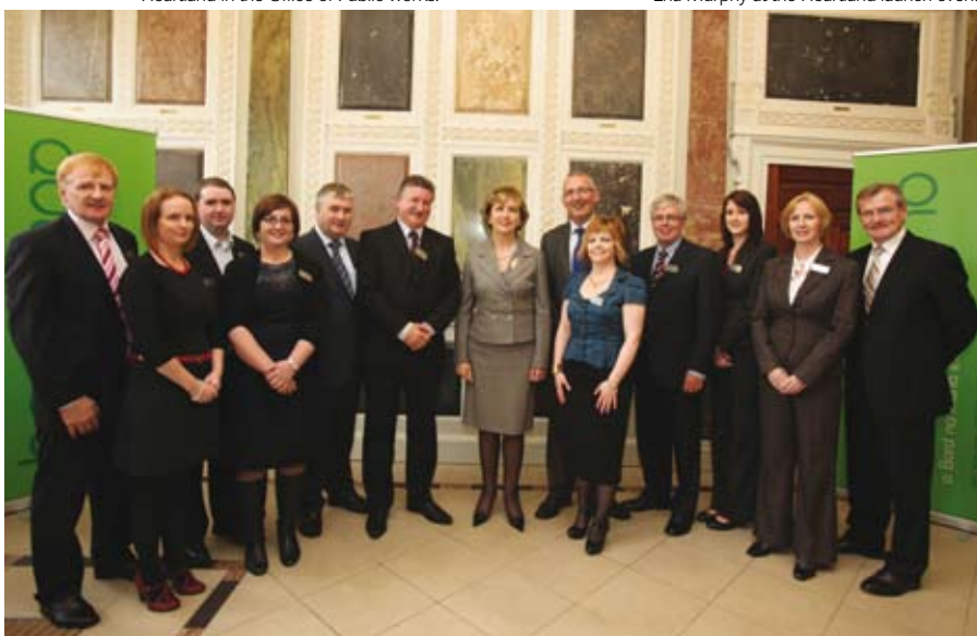
The Heartland project team with President McAleese.

wind energy, renewable fuels, new environmental technologies and waste recycling. It's a different future that beckons but the commitment to Ireland's welfare remains a constant. You are sacred custodians of times and traditions as well as fen and bog and future. These things have been brought carefully to life in this exhibition, which I hope will be enjoyed by many visitors. To Bord na Móna, I say thank you for the last 75 years – ad multos annos. I wish you continued success."