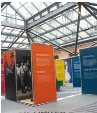
Heartland in the Office of Public works.